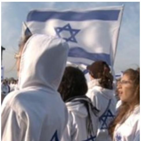
Defamation makes its local debut tonight at CMA Feb 5, 2010